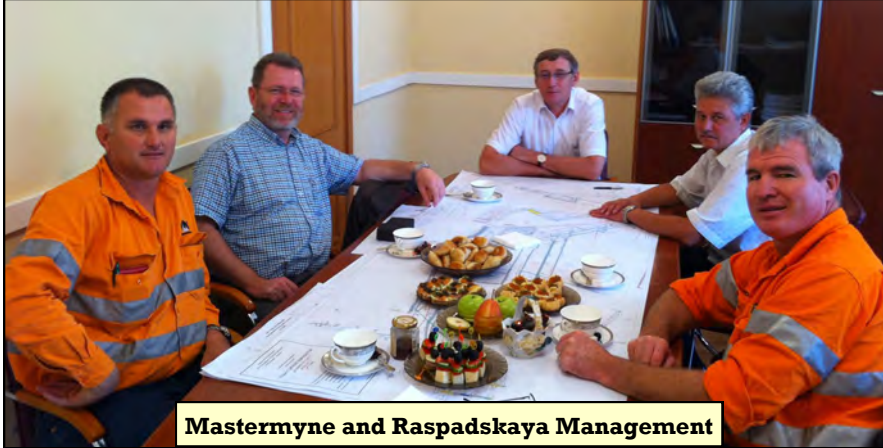
Mastermyne and Rospadskaya Management

The Kuzbass mining region we visited was located approx 3500k east of Moscow; the region produces approx 170 million tonnes of coal from Underground Mines. The climate is extreme and covered by snow for 6 months of the year with temperatures of -30 degrees common. In winter they use boilers to heat the air before it is used to ventilate the underground. Underground conditions vary; they have multiple seams (up to 10) and are mining up to 6 of these seams. Their mining lease only covers to 800m in depth and seam height varies from 1.8m - 10m. Some of the thicker seams are mined in 2 passes with longwalls. Spontaneous combustion is an issue and high levels of gas (methane) are prevalent in most mines. The equipment and conditions underground are very similar to Australia; one mine we visited was using Joy 12-30cm's and had a modern Joy longwall.